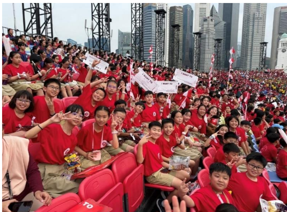
Our Primary 5 students all geared up to enjoy their NE Show experience!